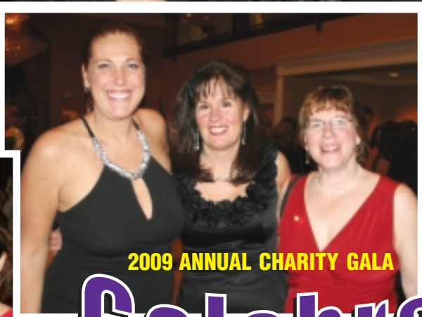
2009 ANNUAL CHARITY GALA